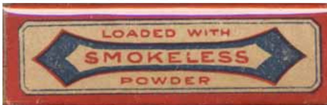
NUBLEND front & Back